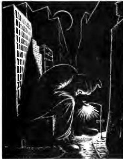
Illustration by Eric Drooker

WBAI's forum for activists will combine analysis of the proposed city budget cuts and the impact of federal and state policies